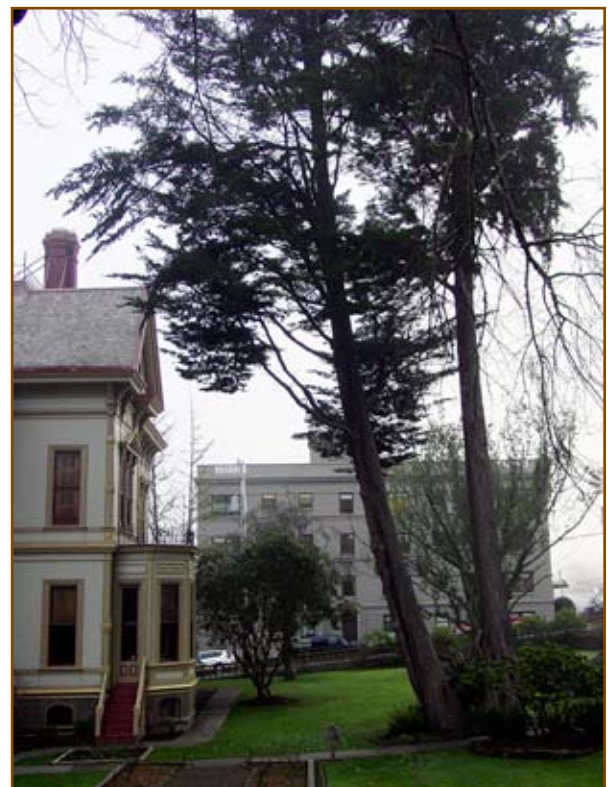
View of the two cypresses on the south lawn looking east.